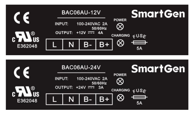
Fig. 2 BAC06AU Panel Mask